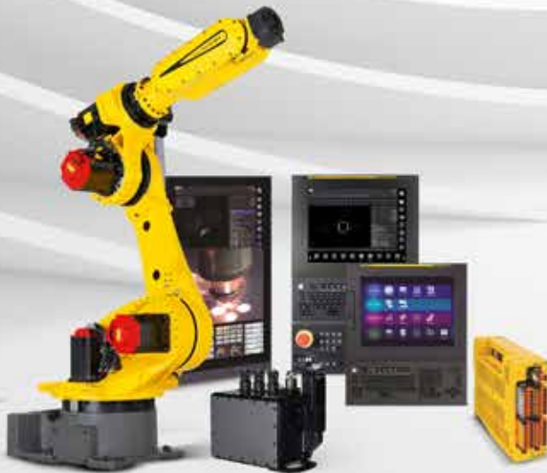
FANUC Laser Solutions