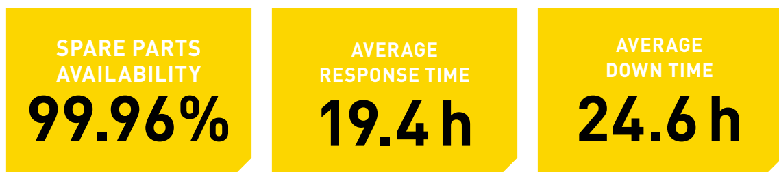
Service KPI's Europe (Jan 2022-Dec 2022)